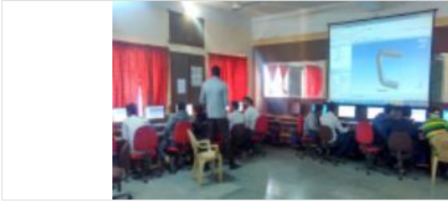
ANSYS Training, Mechanical 6th Sem