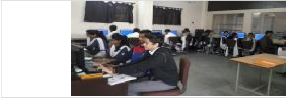
C, C++ Training , Electrical 4th Sem