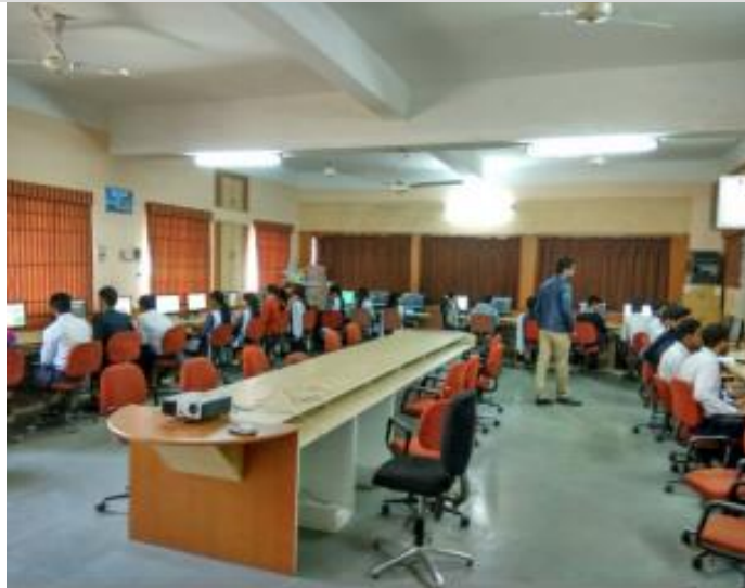
Technical Training of JAVA & PYTHON at Computer Science & Engineering Department