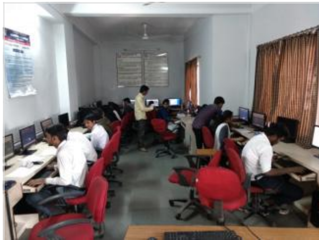
Technical Training of MATLAB & PLC-SCADA at Electrical Engineering Department