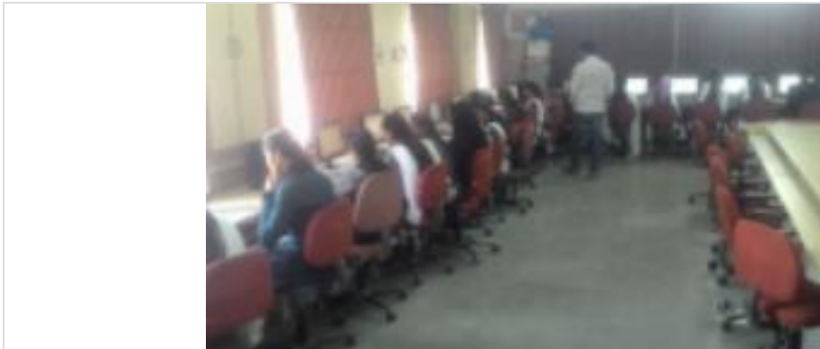
PHP Web Designing Training, CSE 4th Sem