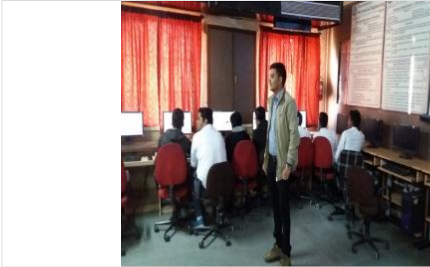
Technical Training of CREO Software at Mechanical Engineering Department