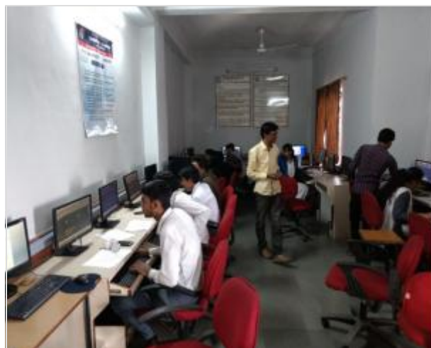
Technical Training of AUTOCAD & STAADPRO at Civil Engineering Department