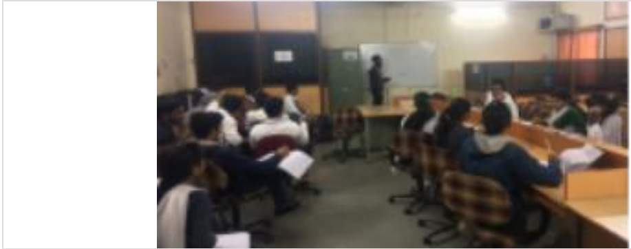
AutoCad Training, Electrical 6th Sem