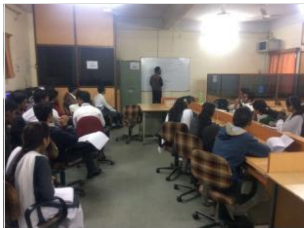
Technical Training of MATLAB & PLC-SCADA at Electrical Engineering Department