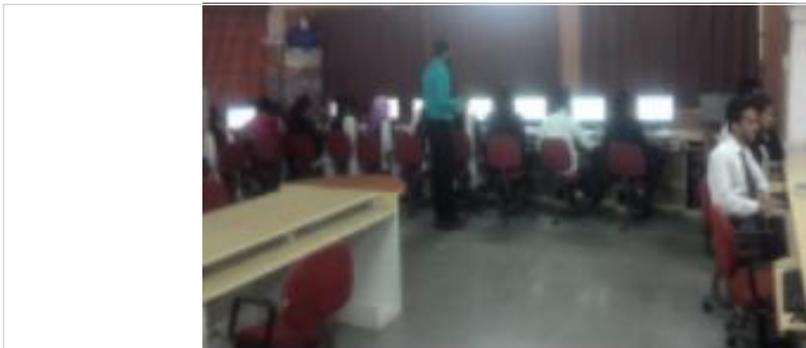
Core JAVA Training, CSE 6th Sem