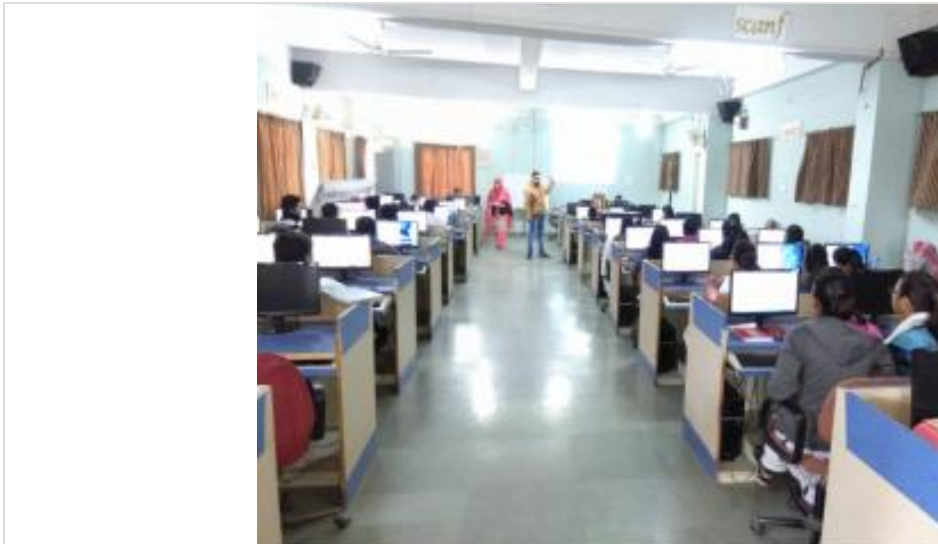
Technical Training of JAVA & PYTHON at Computer Science & Engineering Department