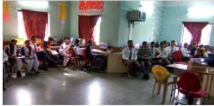
1.76in 3.58in Staad Pro Training, CIVIL 4th Sem