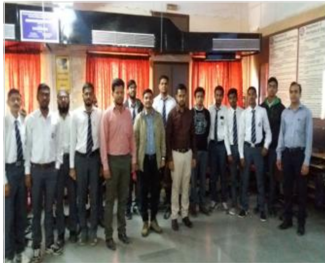
Technical Training of CREO Software at Mechanical Engineering Department