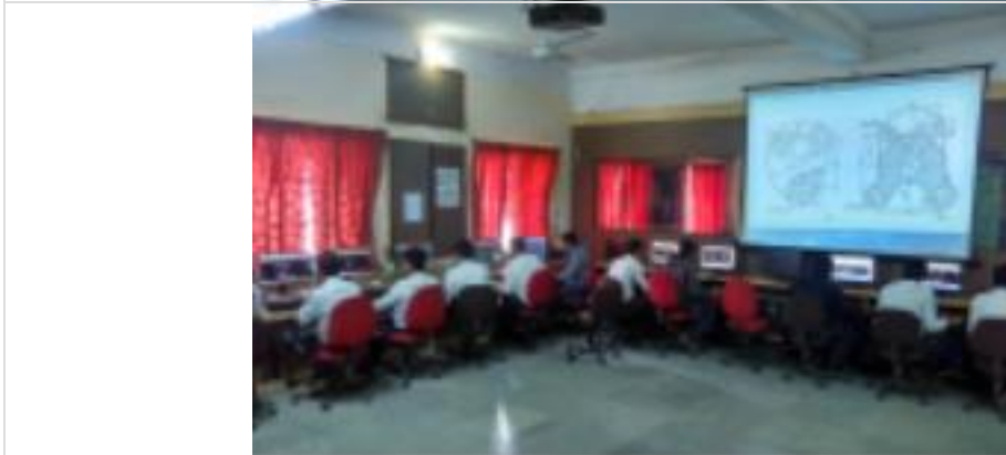
AutoCAD Training, Mechanical 4th Sem