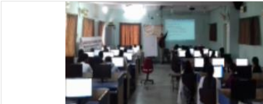
C, C++ & Data Structures Training, EXTC 6 th