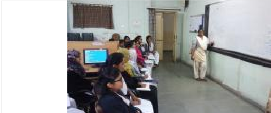
HTML Web Designing Training, EXTC 4th Sem