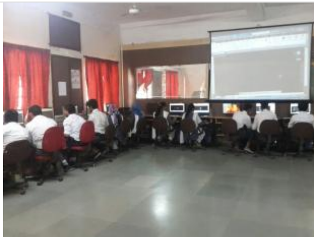
Technical Training of AUTOCAD & ANSYS at Mechanical Engineering Department