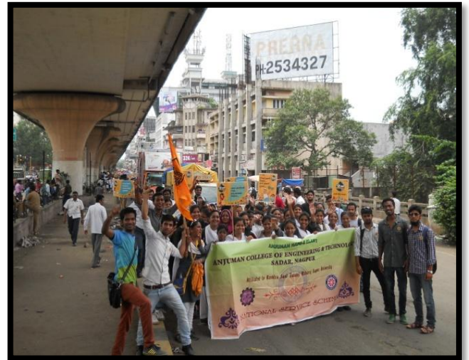
Save Water Initiative