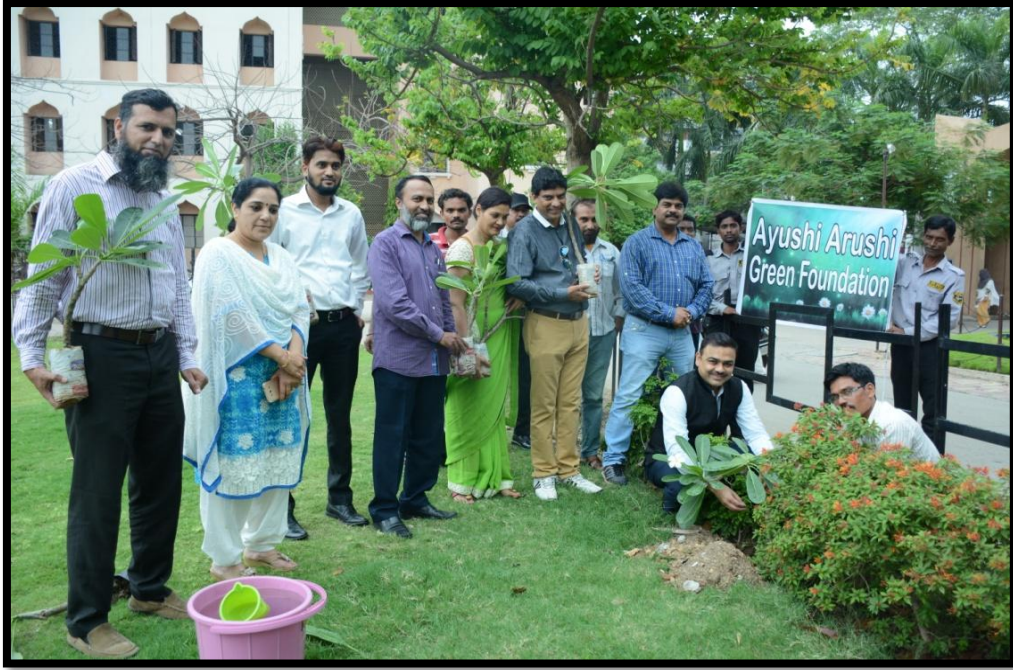
Tree plantation programme for session 2016-17