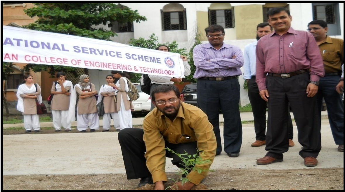
Tree plantation programme for session 2012-13