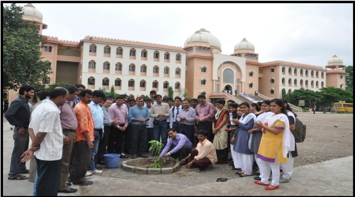
Tree plantation programme for session 2013-14