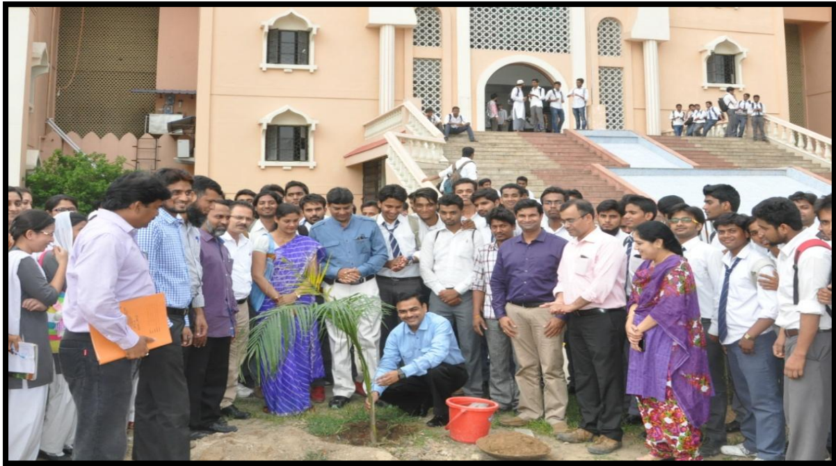
Tree plantation programme for session 2014-15