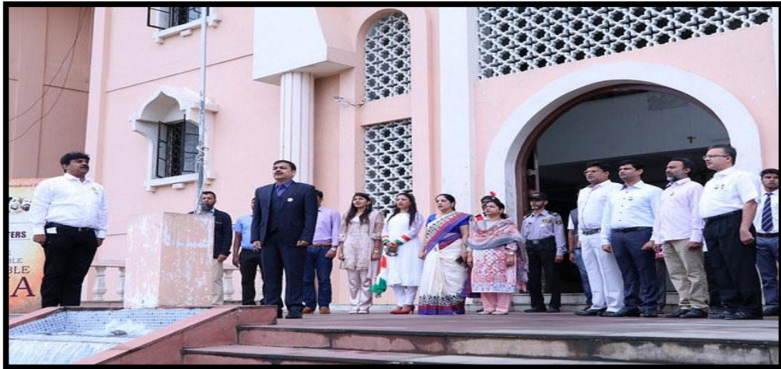
Celebration of Independence Day