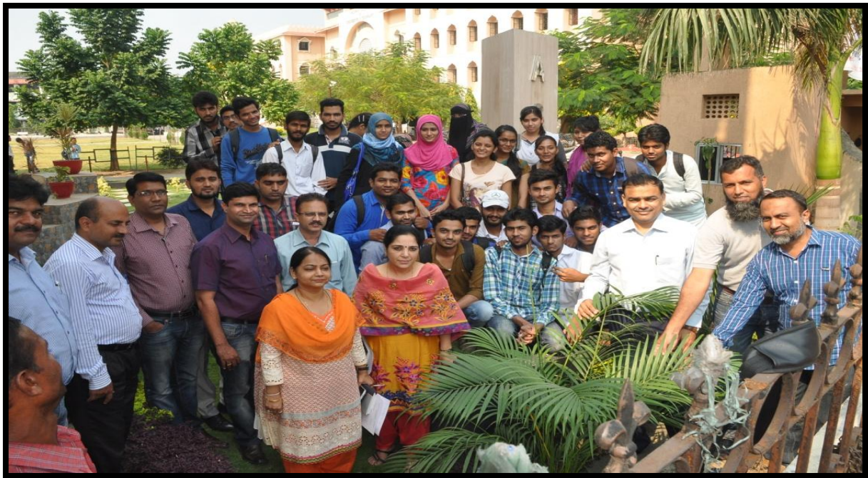
Tree plantation programme for session 2015-16