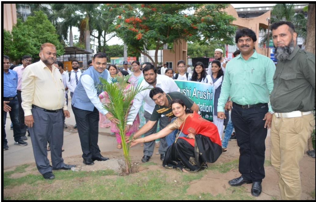
Tree plantation programme for session 2017-18