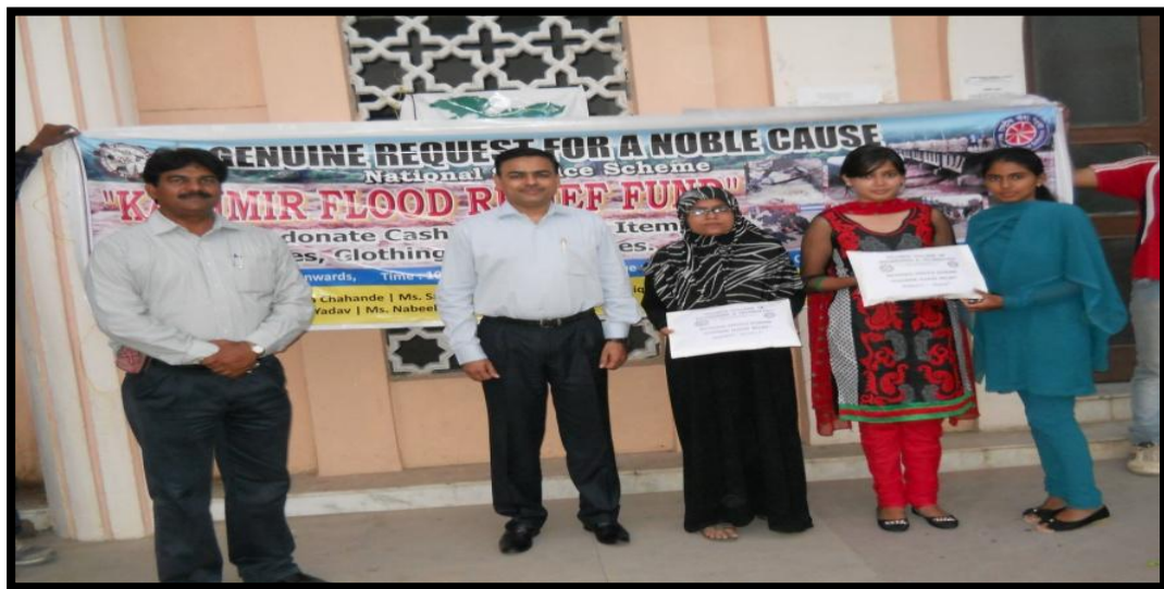
Kashmir-Flood Relief Fund