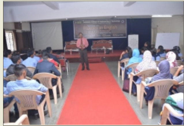
Seminar on Fluency in English