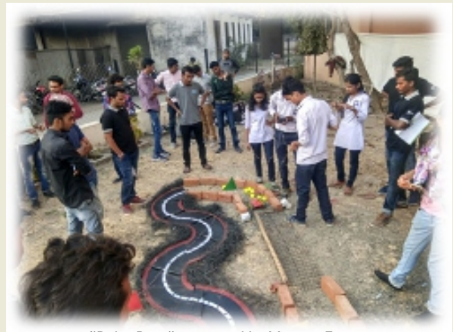
"Robo Race" organized by Xtream Forum