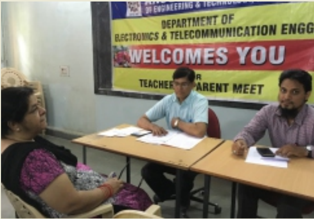
Patents Teacher Meet