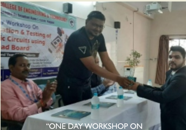
"ONE DAY WORKSHOP ON Workshop on Breadboard Designing