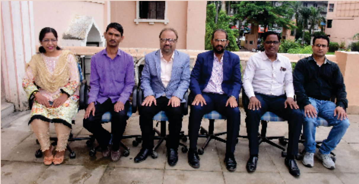
Non-Teaching Staff Members with Principal & Head of Department