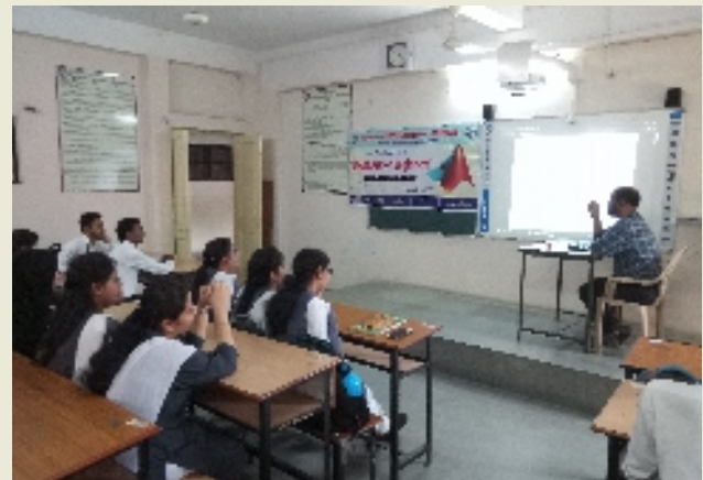
Workshop on Matlab for Beginners