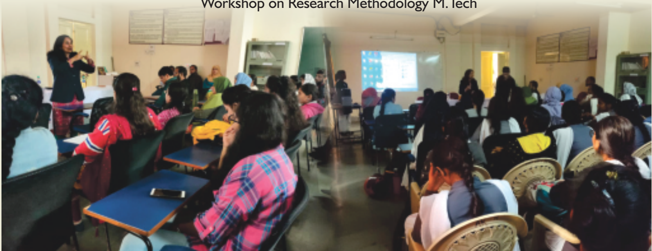
Workshop on Research Methodology M.Tech