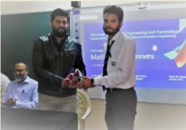
Workshop on Matlab for Beginners conducted