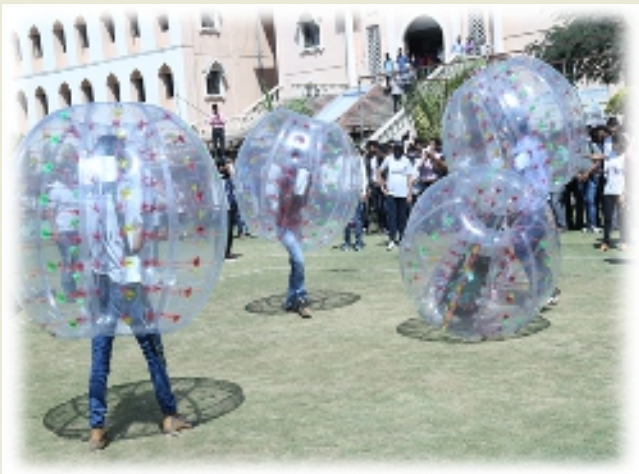
Fun Event "Bubble Battle" organized by Xtream Forum