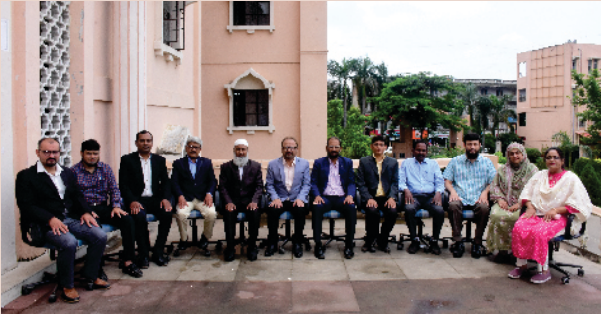
Teaching Staff Members with Principal & Head of Department