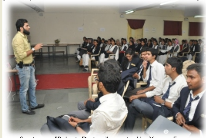
Seminar on "Robotic Designe" organized by Xtream Forum