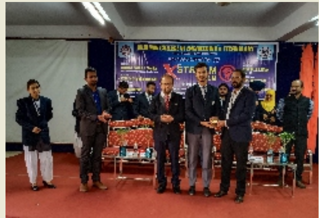
Xstream Forum Installation