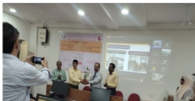
NITTTTR (5th June 23 TO 9th June 23)