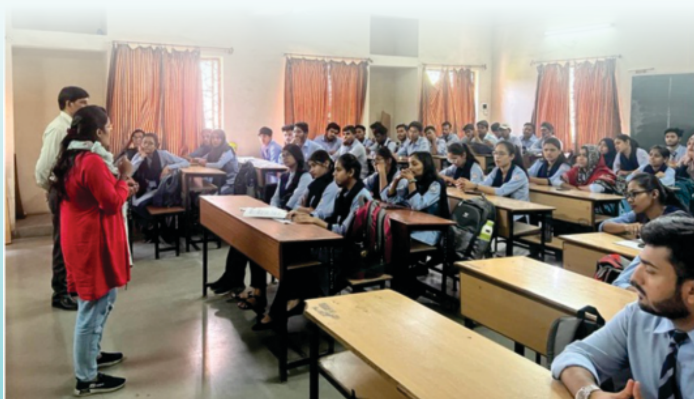
Alumni Interaction (12th May 23)