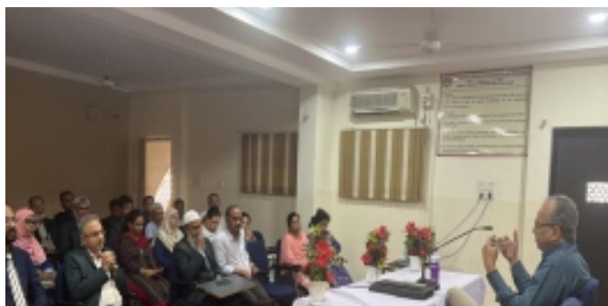
Seminar On wireless Comm(6th March 23)