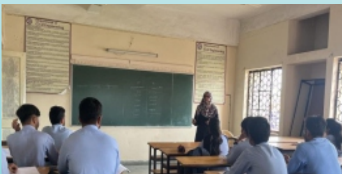
Training Program On Paython Big.(23rd Jan'23 to 15th Feb'23)