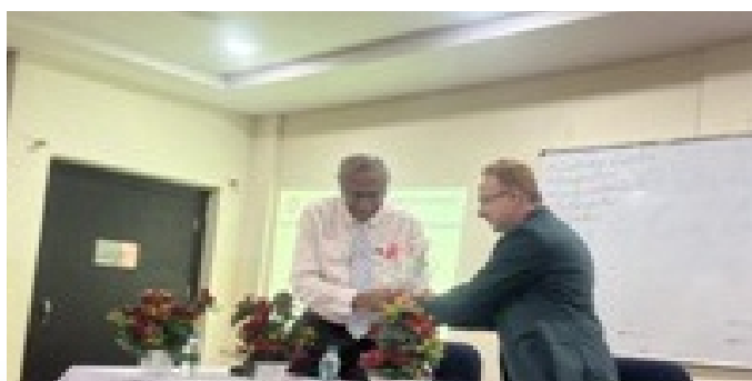
Unlock for potential