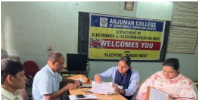
PTM (19TH Oct'23)