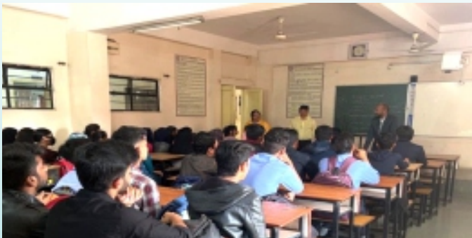
Induction Program First Yr(23rd Nov'23)