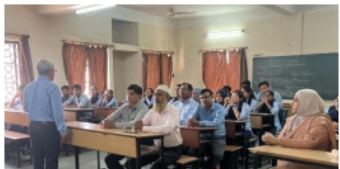
Art of Paper Writing(5TH Nov'23)