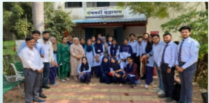
Panchvati Vrud ashram (12th Dec'22)