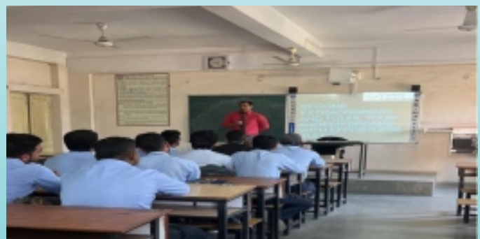
GD,WAT&PI (6th Feb'23)