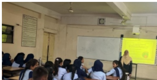
Introduction to AI&ML (1st April'23)