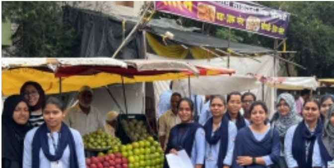
Survey at Mangalwari bazar (7th oct'22)