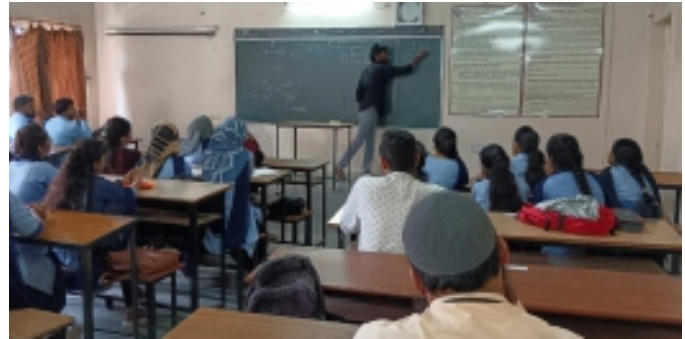
Seminar on B.E Optimistic for Higher Studies (14th sep'22)